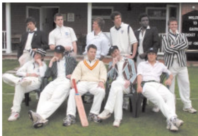
ABOVE: THE COLLEGE MASTERS AND BOYS CIRCA 2006

(with apologies to the East Anglian Daily Times report of 1906)