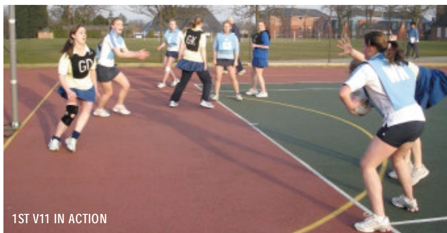
1ST V11 IN ACTION

The U14 VII had a mixed season. The team achieved some creditable wins, particularly against Leiston High, Thomas Mills High