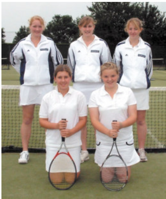
ABOVE: THE ABERDARE CUP TEAM

This has been a fantastic year for the girls tennis teams. With our major strengths coming through the lower end of the school, things will hopefully get even better next year. The girls have played a lot of fixtures this term. The first four have played a total of 15 matches over the course of the ten week term as well as balancing exams and other extra-curricular activities. The results