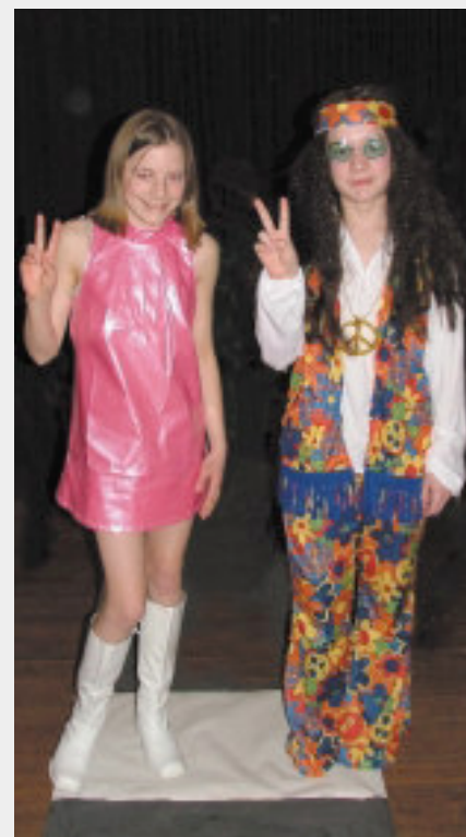
ABOVE: FLOWER POWER OF BEATLES NIGHT. BELOW: CERAMIC PAINTING IN THE ART ROOM

Unfortunately there isn't enough space to show pictures of all the trips and events we have undertaken, but I hope these few give you a flavour of what we have done. Whether it was a trip to Pleasurewood Hills, watching the Chelmsford Chieftains,