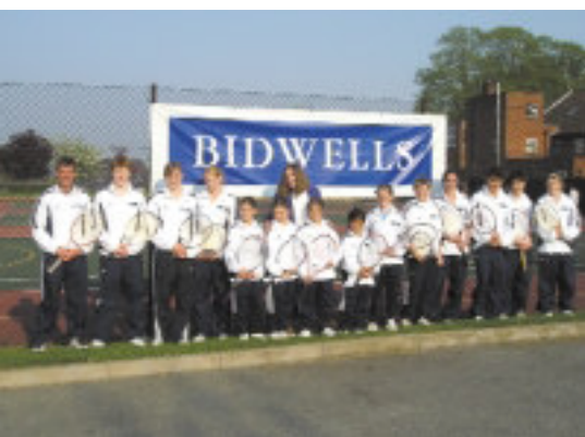
ABOVE: THE FRAMLINGHAM COLLEGE TENNIS CLUB WAS FORMED IN MAY

One of the most exciting things to happen was the formation of Framlingham College Tennis Club. With this comes affiliation to the LTA which has opened up many exciting avenues to further tennis at both our junior and senior schools. This is based at Brandeston Hall over the winter period and