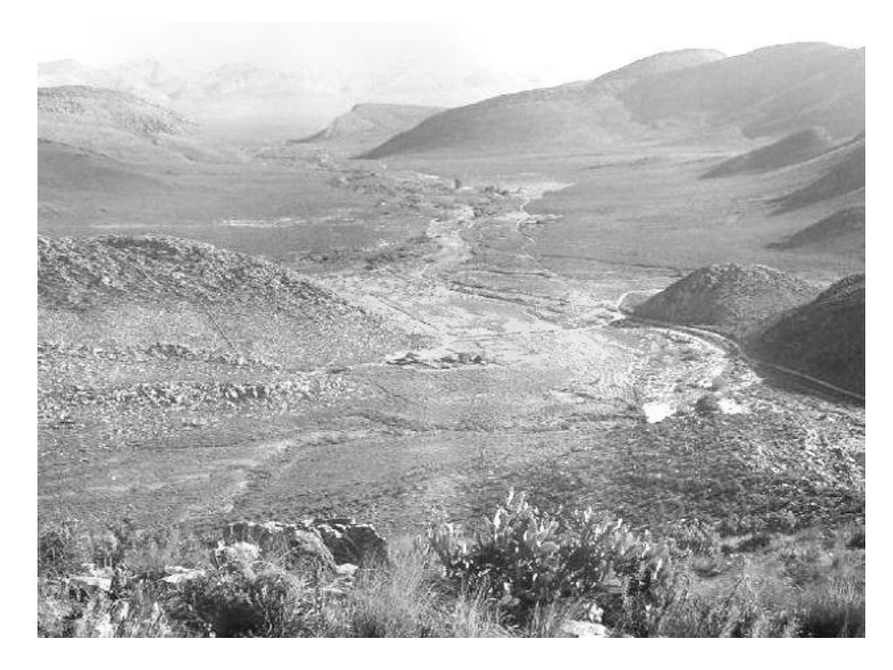
Matjiesfontein was flanked by mountains

The farm was 250 km north-east of Cape Town near the picturesque village of Matjiesfontein. Peter was to discover that Matjiesfontein, a "railway town" on the route connecting the diamond fields of Kimberley to Cape Town's port, had a colourful history. It dated from 1880 and owed its transformation from an insignificant, desolate place with a solitary shed to a fashionable tourist resort, to James Logan, a dynamic, unorthodox man originally from Scotland. He had been shipwrecked at Simonstown on the eastern side of Cape Peninsular with only a few pounds in his pocket, and walked to Cape Town. There he had found a job on the railways, and from being a penniless porter he was to become one of South Africa's wealthiest men.