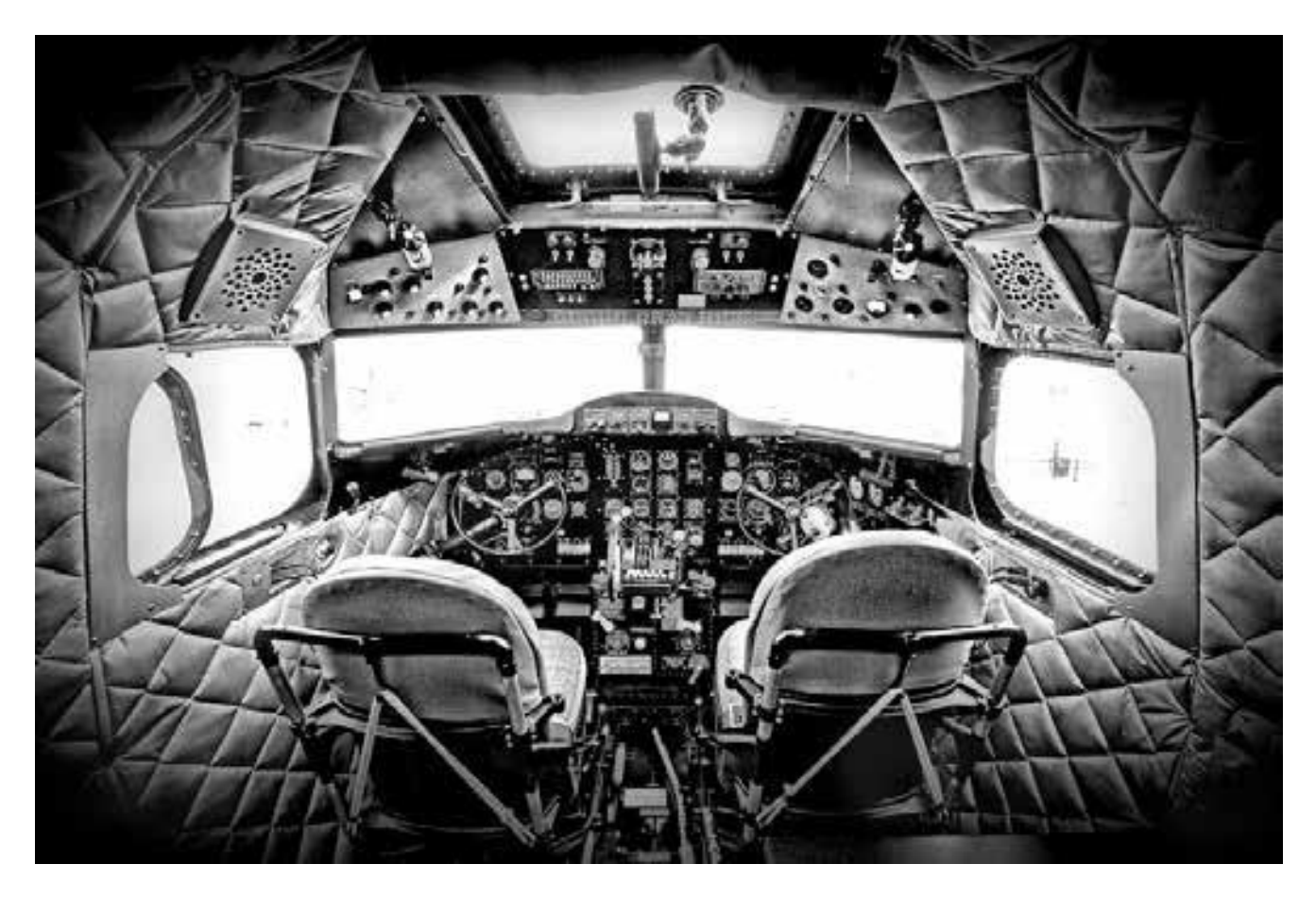
Peter felt at home in the Dakota's cockpit

Transport Command played an essential part in ensuring the success of the D-Day assault. Operation Tonga – the seizing of two bridges near Caen – was considered critical to securing the Normandy landings, due to start a few hours later than Tonga. The two important bridges were Bénouville Bridge over the Orne Canal (later named Pegasus Bridge after the flying horse emblem worn by the British airborne forces) and Ranville Bridge, a road bridge about 400 metres to its east. The latter bridge was renamed Horsa Bridge to honour the glider airmen and aircraft involved in the operation.