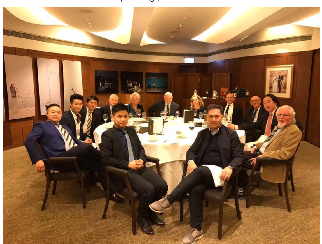
After meal picture