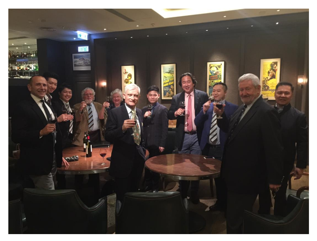
After dinner drinks