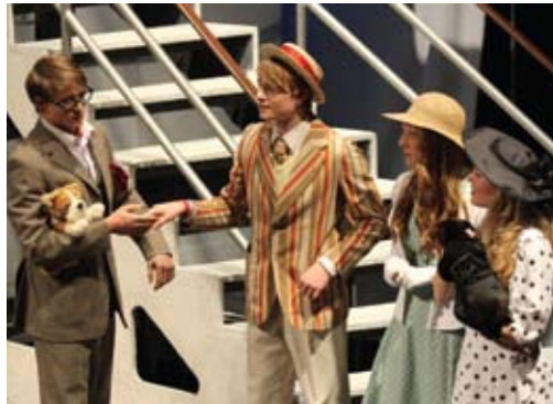
As well as a marvellous set and fantastic acting, the audience were treated to Didi's four paw performance.