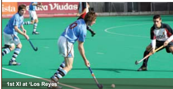
1st XI at 'Los Reyes'

The boys' 1st XI travelled to Barcelona to play in the 62nd International Hockey Tournament 'Los Reyes', which was hosted by Real Club de Polo. This is a highly prestigious event to which only the best are invited, with international male and female sports stars participating. It was a great honour therefore to be involved in the official tournament curtain raiser against the hosts, this was followed by fixtures against the Spanish national Under 16s and FC Barcelona. Our young squad acquitted itself with zeal and commitment throughout, but lost out in an end-to-end 5-3 defeat to FC Barcelona. However, it was a great experience for all of us, playing and watching top class international hockey in such truly spectacular surroundings!