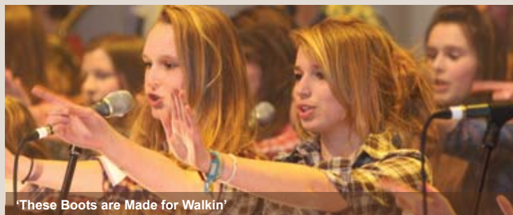
'These Boots are Made for Walkin'