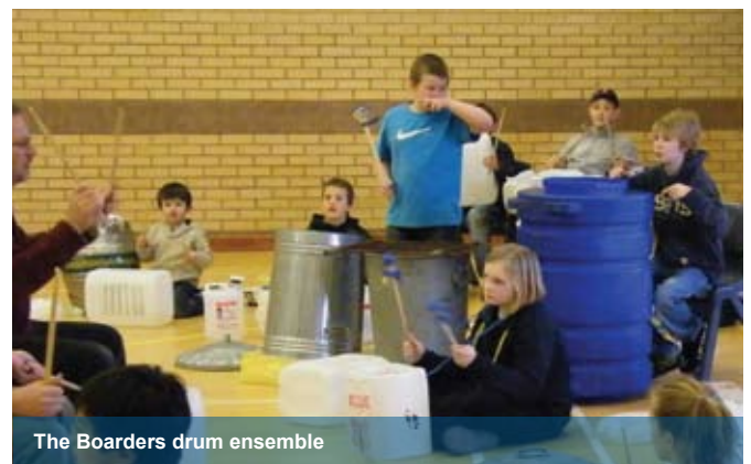
The Boarders drum ensemble

Other activities this term have included shooting at the College range, go-karting and creating pieces of jewellery for Mother's Day.