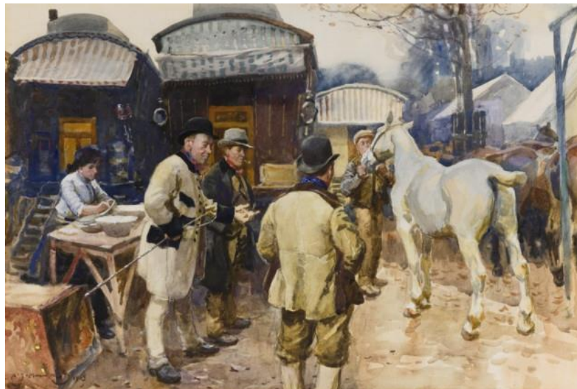
Munnings' The Horse Fair

Two pictures painted by Sir Alfred Munnings in the early 1900s before he became famous are set to fetch around half a million pounds when they are auctioned in America later this month.