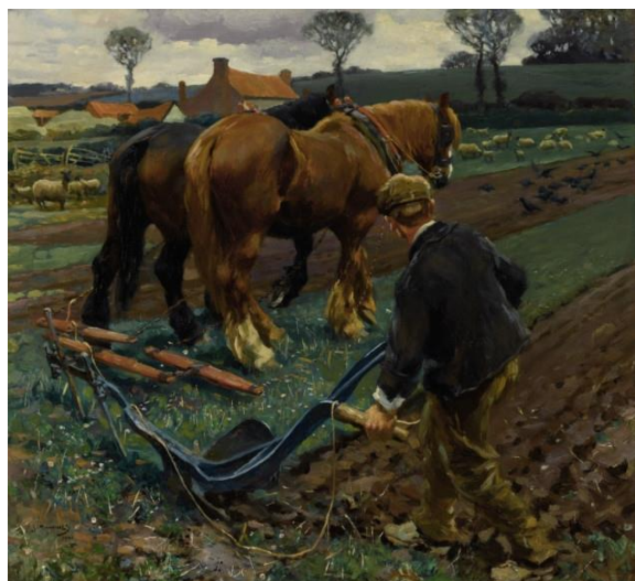
Munnings' The Plough In Early Spring

Munnings' 1901 oil painting The Plough In Early Spring is expected to sell for between $400,000-$600,000 (£325,000-£484,000) at the auction at Sotheby's in New York on November 22, while his 1905 watercolour The Horse Fair is likely to fetch between $125,000-$175,000 dollars (£100,000-£140,000).