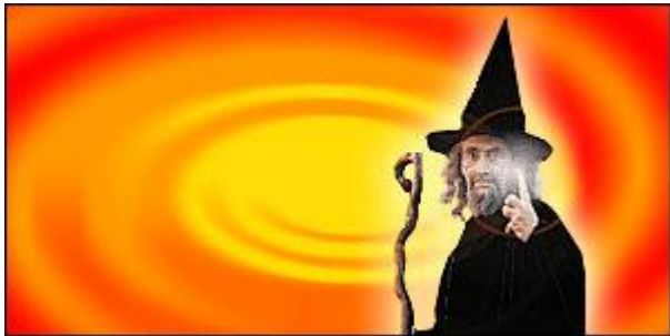
The Wizard as he looks today.