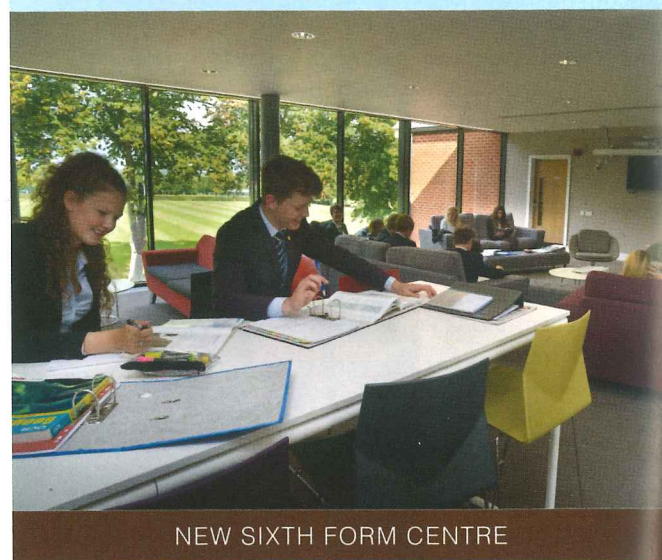
NEW SIXTH FORM CENTRE

Book a private visit today: admissions@framcollege.co.uk