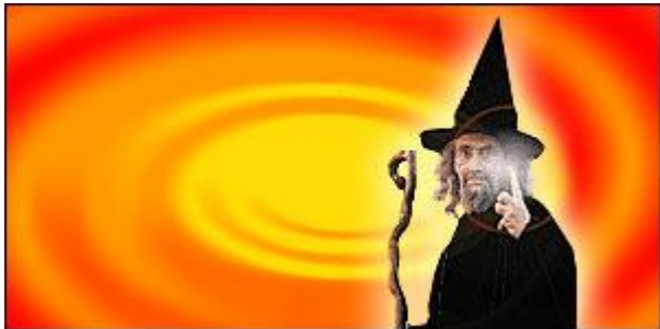
The Wizard as he looks today.